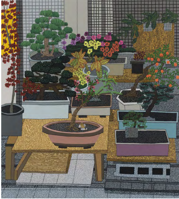
Jonas Wood, Bonsai Still Life , 2024, oil and acrylic on canvas, 66 × 60 inches (167.6 × 152.4 cm) © Jonas Wood. Photo: Marten Elder

Presentations Coincide with Exhibition by Donald Judd at Gagosian's Basel Gallery