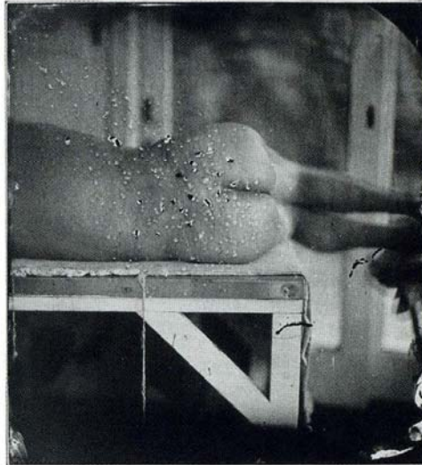
Sally Mann, Kingfisher's Wing , 2007, black-and-white photograph, 15 x 13 ½".