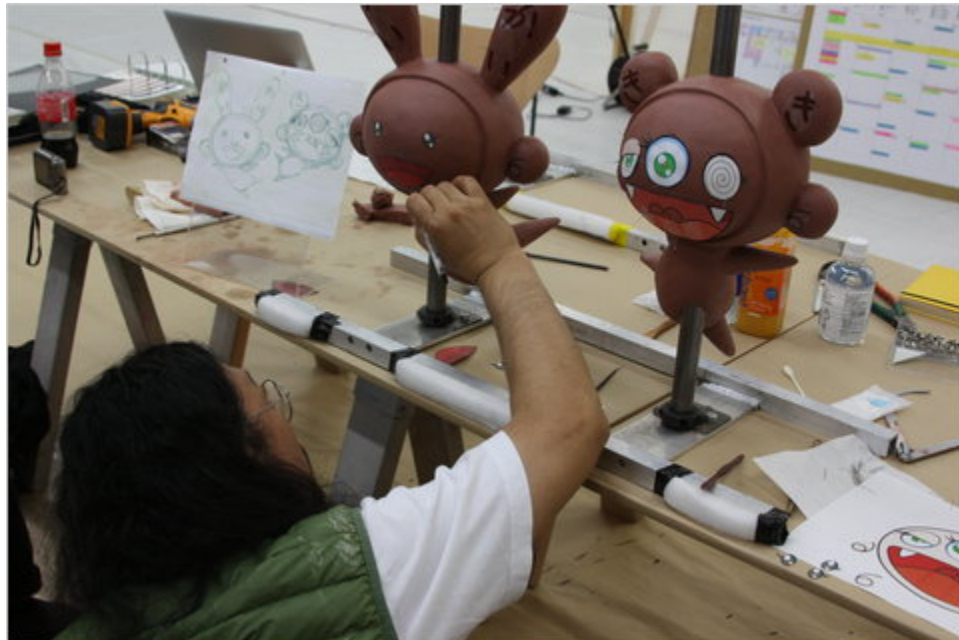
All Artwork including Kaikai and Kiki (c)Takashi Murakami/Kaikai Kiki Co., Ltd. All rights reserved.