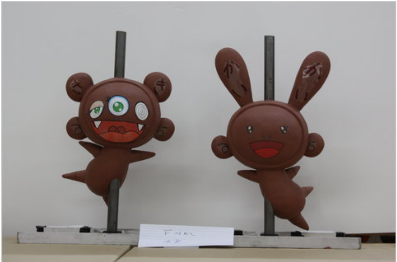
All Artwork including Kaikai and Kiki