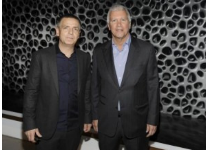
Andreas Gursky and Larry Gagosian