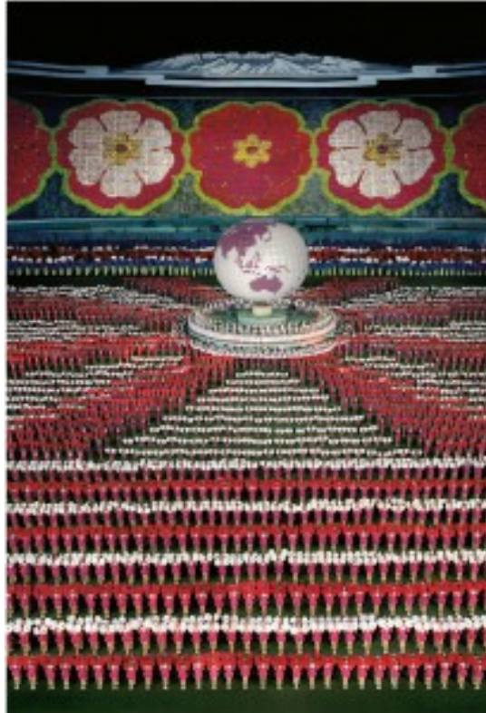
Copyright: Andreas Gursky, Pyongyang I , VG Bild-Kunst, Bonn 2010, via Gagosian Gallery

The resulting images become what the artist calls “an encyclopedia of life.” They successfully merge representations of the natural world with ideas of metaphysical contemplation. The formal qualities of the works: bold, edgy and abstract while at the same time empirical and representative develops a dialogue often found in Gursky’s work between the genres of paintings and photography.