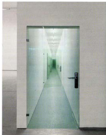
Tatiana Trouvé From Here I Disappear 2009 Mixed media Dimensions variable