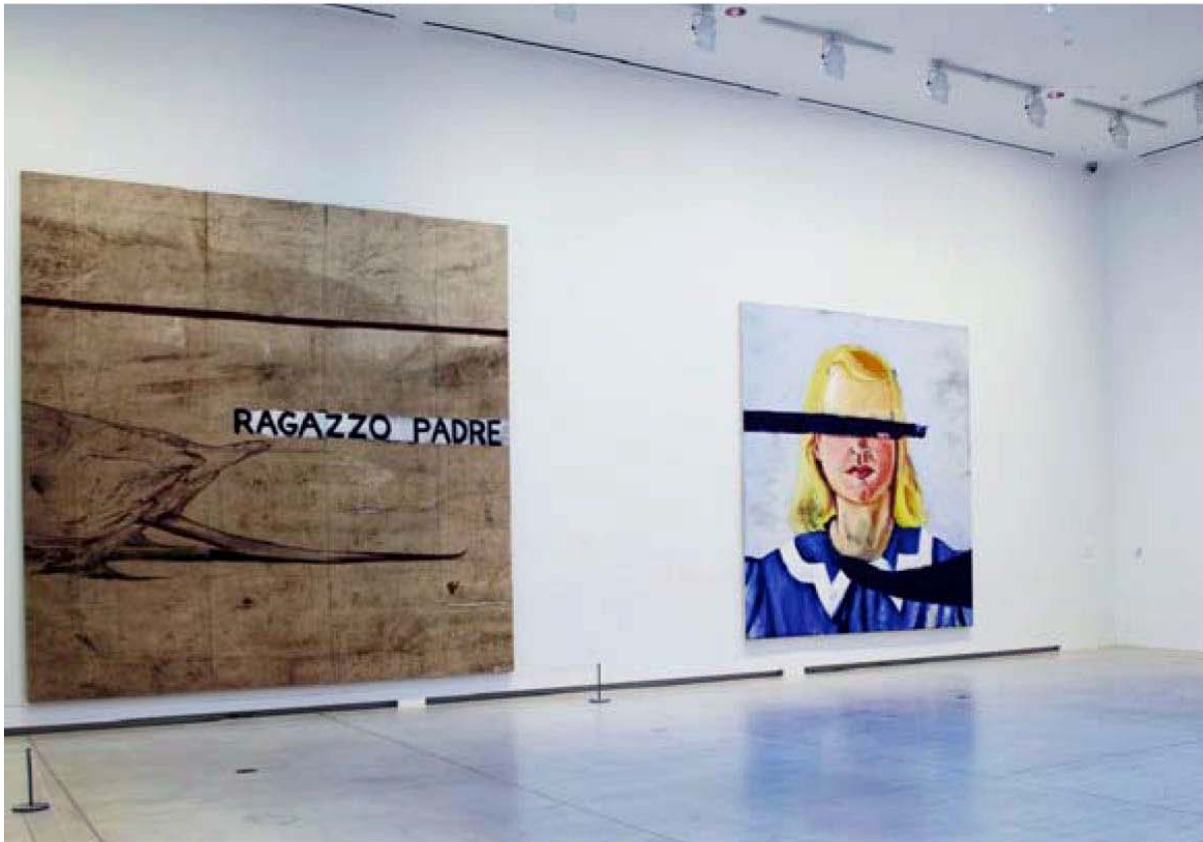
Left to right, Ragazzo Padre , 1988, oil and gesso on tarpaulin, 16 feet square; Large Girl with No Eyes , 2001, oil and wax on canvas, approx. 13½ by 12½ feet; Jane Birkin #2 , 1990, oil and gesso on sailcloth, 16 by 26 feet. Courtesy Art Gallery of Ontario. Photo Ian Lefevbre.

a plea for a miracle. They are endowed with a spiritual power, and also serve as proof of presence, of the believer's pilgrimage to a particular holy site.