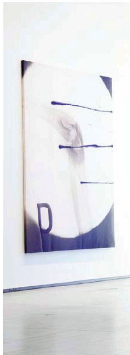
Left, Untitled (X-Ray), 2008, ink on polyester, approx. 12½ by 9½ feet; right, Australia, 1986, oil, plates and Bondo on wood, 11 by 17 feet.