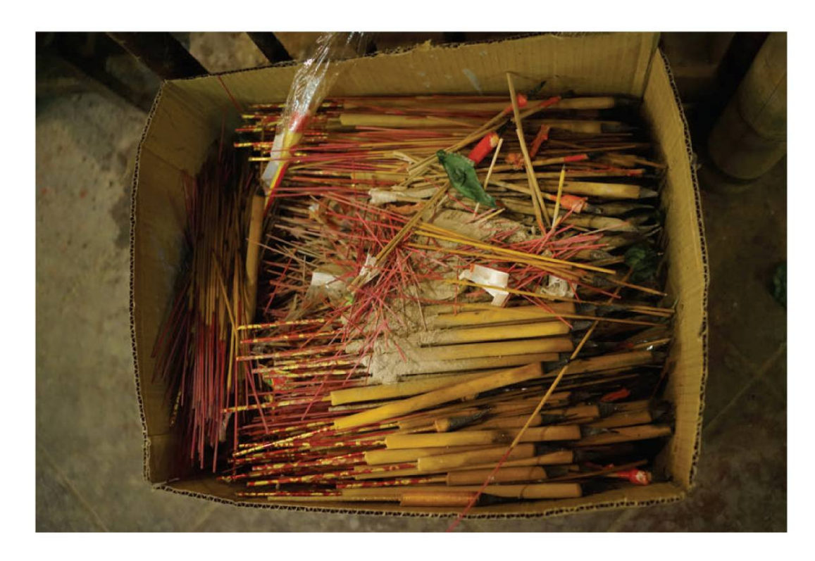
Day 12: Saturday, September 13

I continue the install at Gagosian. I quickly go to the Joyce Boutique, located right across the street, to check out the window display that they have done for the Raf Simons / Sterling Ruby collaboration. I have two hours before the opening. Natasha and I dedicate time to go to the Man Mo Temple at 124–126 Hollywood Road, Sheung Wan.