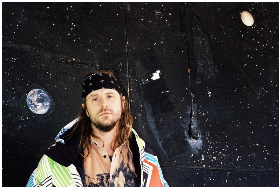
Sterling Ruby, Los Angeles, 2013.

Take a look at one of Sterling Ruby's fluorescent spray paintings and it will likely make you see something else. In the hazy horizontal stripes of color, from grays and blacks to rose pink and emerald green, one might see a cross section of muscle or skeletal tissue under a microscope; the surface of an extraterrestrial planet; a broken television humming with static; or maybe just a Color Field painting. The inspiration behind these works, however, lies elsewhere—literally, on the horizon. The new suite of spray paintings that collectively form the exhibition “Vivids,” at Gagosian Gallery's Hong Kong space, were inspired by the sky, particularly the smoggy Los Angeles sky that engulfs Ruby each day, as he drives into and out of the Downtown area where his studio is housed. For the artist, the daily commute has become a ritual; a recurring journey through which he has witnessed countless sunrises and sunsets, beckoning hours on end of contemplation. The resulting abstractions are intriguing, fresh compositions that transcend any particular geographic or cultural lexicon, making them especially fitting for the Hong Kong space. These glowing beacons, lined up along the walls of the stark white Pedder Building, look out onto a new horizon, and across the Asian continent at this moment, several other simultaneous exhibitions of Ruby's works do the same.