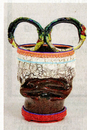
Top, "Pretty Raw" at the Rose Art Museum. Among the works are "Flat World," above, and "Four Dreams in an Open Room," left.