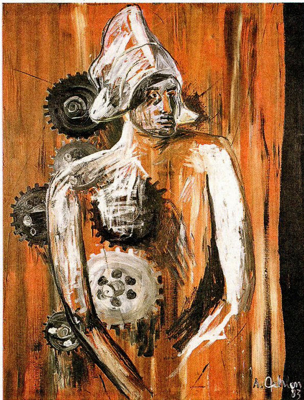
COLLECTION MAURICE MARCIANO

"Albert Oehlen: Home and Garden" runs through Sept. 13 at the New Museum, 235 Bowery, at Prince Street, Lower East Side; 212-219-1222, newmuseum.org .