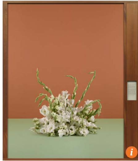
'Agreement for cooperation on China's Beidou Navigation Satellite System in Pakistan. Aiwan-e-Sadr, Islamabad, Pakistan, May 22, 2013' from 'Paperwork and the Will of Capital', by Taryn Simon, 2015.

Her modus operandi reveals a hidden passion beneath the cold erasure of emotion from the photographs. Simon said at the opening of her Hong Kong exhibition that getting access for her projects was often a test of endurance, and her battles with red tape should be thought of as performance art and an important component of her work.