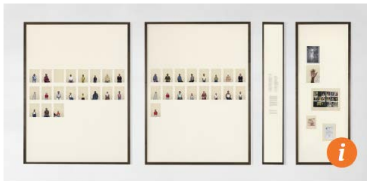
'A Living Man Declared Dead and Other Chapters I-XVIII', by Taryn Simon.

The latter is part of the series called A Living Man Declared Dead and Other Chapters I – XVIII . Simon spent four years from 2008-2011 travelling around the world researching and recording families who have lost members to cruel superstition, to civil war, or in the case of feral rabbits in Australia, to biological warfare designed to wipe them out. Each panel has a photographic family tree with gaps representing the dead and the missing. The unsmiling faces of the three generations she photographed are as blank as the uniform, beige background. Textual explanations on the other side provide the context.