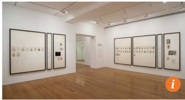
Part of the 'Portraits and Surrogates' exhibition by Taryn Simon.

The latter is part of the series called A Living Man Declared Dead and Other Chapters I – XVIII . Simon spent four years from 2008-2011 travelling around the world researching and recording families who have lost members to cruel superstition, to civil war, or in the case of feral rabbits in Australia, to biological warfare designed to wipe them out. Each panel has a photographic family tree with gaps representing the dead and the missing. The unsmiling faces of the three generations she photographed are as blank as the uniform, beige background. Textual explanations on the other side provide the context.