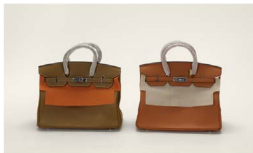
'Handbags, Hermès (counterfeit) (detail)', 2010, by Taryn Simon.

She adopts the same dispassionate gaze for Contraband (2010), a police line-up of more than a thousand items seized at the New York airport.