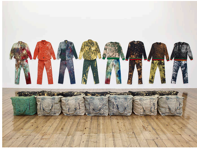
Installation of Ruby's WorkWear show at Sprüth Magers, March 2016

Art and fashion have been enjoying a fruitful crossover of late. But, generally, the enthusiasm comes from fashion towards art, as if using the medium as a way to legitimise the endeavours of designers and, maybe, distract from the sordid topic of coin. Ruby's enthusiasm for fashion is near unique.