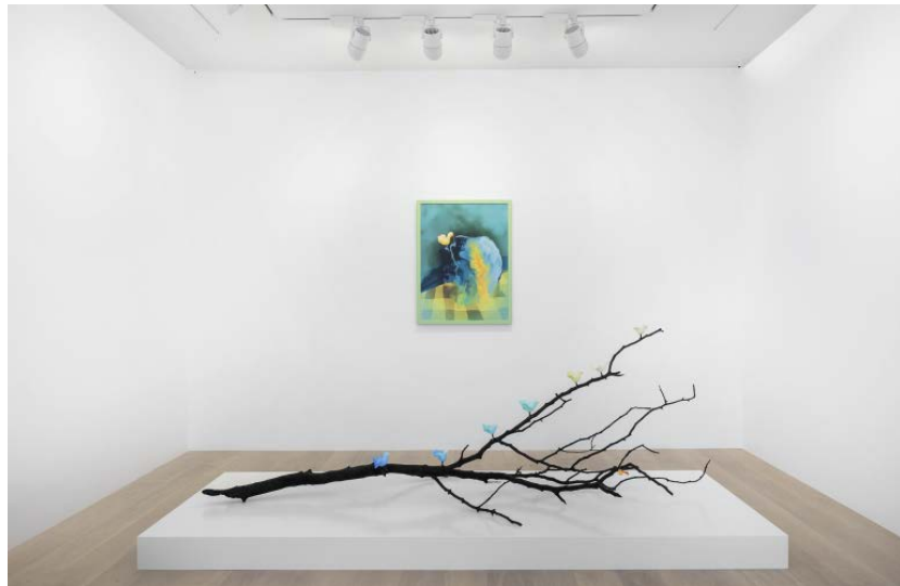
Urs Fischer, Installation View, 2019.