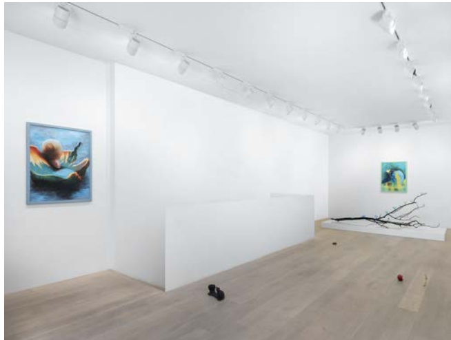
Urs Fischer, Installation View, 2019.

This attention is due to the fact that Urs Fischer's work is clever and subversive while at the same time, playful and interactive. He is perhaps best-known for his sculptures, and a newly published book titled "Sculptures 2013-2018" provides the impetus for the Geneva exhibition. Fischer has made work ranging from a clay Katy Perry sculpture into which visitors were invited to carve their own "art", to a Swiss chalet made entirely of loaves of bread. Since the 2000's, he has created candle sculptures made of wax, with his "Rape of the Sabine Women", a copy of Giambologna's sculpture melting over an ordinary man, for the Venice Biennale.