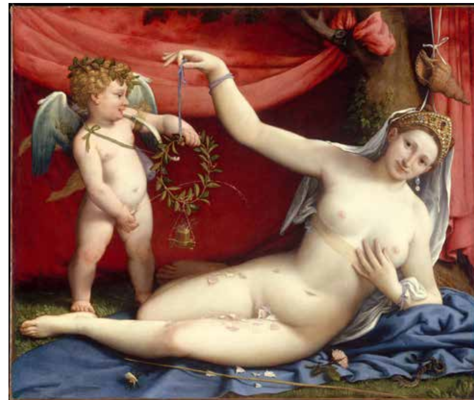
Lorenzo Lotto, Venus and Cupid , 1520s, oil on canvas, 36 3/8 x 43 7/8 in. Purchase, Mrs. Charles Wrightsman Gift, in honor of Marietta Tree, 1986

BONNET Yes, they could be, metaphorically. But also, why would your kids need to be sentries? I haven't explored