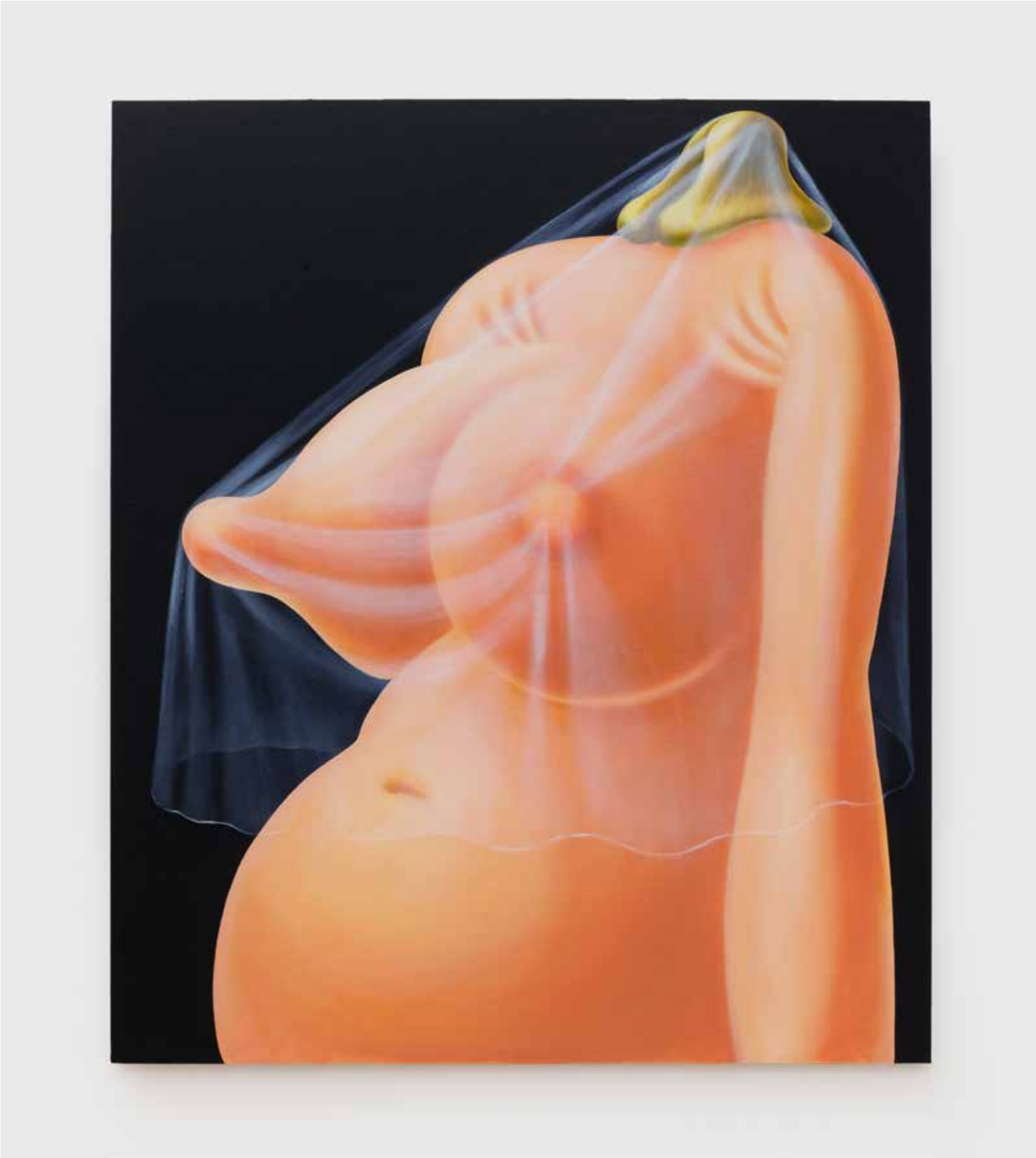
Louise Bonnet, Veiled Nude, Bloated Belly , 2019, oil on linen, 66 x 56 inches, courtesy of the artist and Galerie Max Hetzler/Gagosian

POWERS Are there mythological forces at work in your paintings?