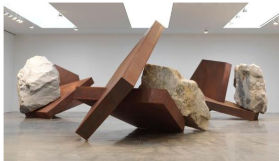
Installation view, 2022

Michael Heizer is a legend. His name carries so much weight that I hold my breath before I round the corner of any museum where he's featured. His "negative sculptures" at Dia Beacon terrify and tempt me while " Levitated Mass " at LACMA in Los Angeles dares visitors to walk under a 340-ton boulder. Heizer's 50-years-in-the-making sculpture " City " will be one of the largest sculptures ever built when it's completed. You feel Michael Heizer's sculptures in your gut, and this current exhibition of new sculpture is no exception at Gagosian Gallery in New York.