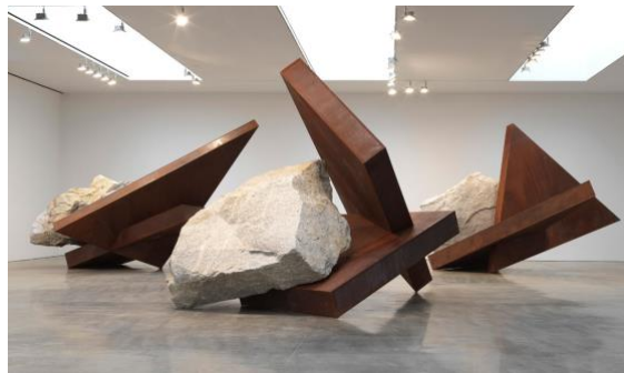
Installation view, 2022

Michael Heizer is a legend. His name carries so much weight that I hold my breath before I round the corner of any museum where he's featured. His "negative sculptures" at Dia Beacon terrify and tempt me while " Levitated Mass " at LACMA in Los Angeles dares visitors to walk under a 340-ton boulder. Heizer's 50-years-in-the-making sculpture " City " will be one of the largest sculptures ever built when it's completed. You feel Michael Heizer's sculptures in your gut, and this current exhibition of new sculpture is no exception at Gagosian Gallery in New York.