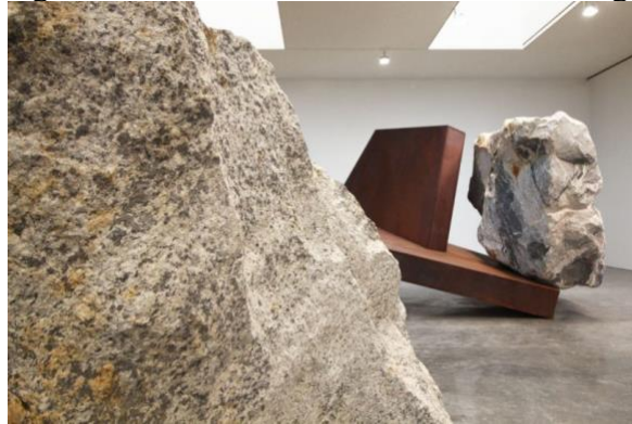
Installation view, 2022

But that weight is in contrast with the visual “lightness” of the steel. The flat surfaces neither bend nor buckle under the rocks and barely touch the floor. The pairing of those two opposites is as beautiful as it is unsettling. I’m entranced and nervous, as if circling a sleeping beast.