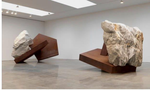
Installation view, 2022