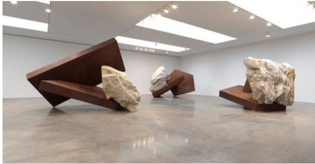
Installation view, 2022

The exhibition is on view at Gagosian Gallery through April 16 th . Visit, stay, and circle each work to experience the play of forms, mass, material, and balance. If you're new to Heizer, I highly recommend watching this documentary about the journey of the aforementioned 340-ton-boulder in Los Angeles in 2012. Here's the trailer: