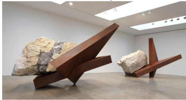
Installation view, 2022

Beyond the play of danger and lyrical beauty, each sculpture is a paradox of weight. Heizer has the unique ability to transmit the gravity of extreme mass. Though there are larger boulders in Central Park, none feel as heavy as these.