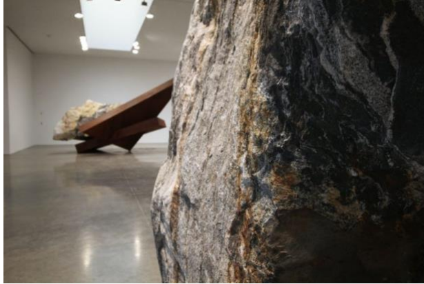
Installation view, 2022