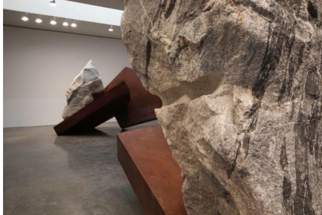
Installation view, 2022