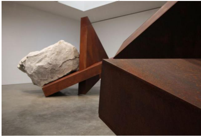
Installation view, 2022