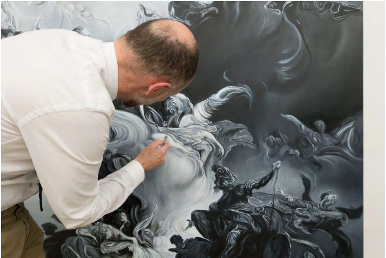
At work in the studio.

Show us a few different photos of a work in progress in a way that you think will provide insight into your process.