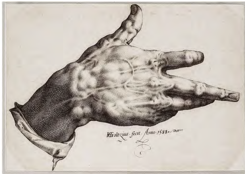
Hendrick Goltzius's drawing of a hand at the Teylers Museum.

What's the last museum exhibition or gallery show you saw that really affected you and why?