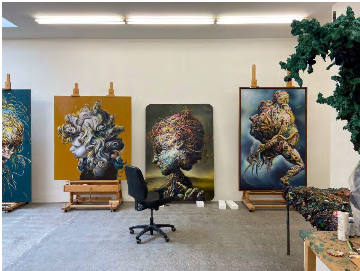
The main studio floor with works for NYC 2022 show. Courtesy of Glenn Brown.

Glenn Brown is an artist who finds unceasing inspiration in art history. The British painter recently opened the Brown Collection, which debuted with an exhibition of his own art, in a restored house in London's Marylebone neighborhood. Works on view range from early appropriations of Frank Auerbach and Jean-Honoré Fragonard to layered portraits that put a twist