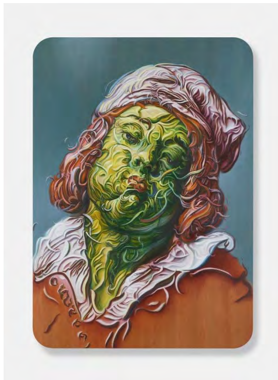
Glenn Brown, Dirty Creamer (2022).

I used the colors from this work for one of my new paintings for the November show, Dirty Creamer (2022). I love Osman Spare's delicate pencil lines.