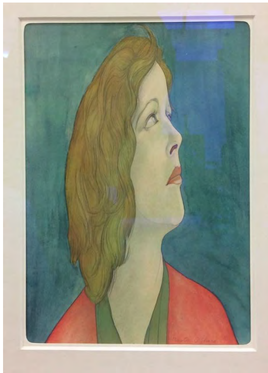
Austin Osman Spare (1886–1956), Green Sidereal, watercolor and pencil on card. Courtesy of Glenn Brown.

I used the colors from this work for one of my new paintings for the November show, Dirty Creamer (2022). I love Osman Spare's delicate pencil lines.