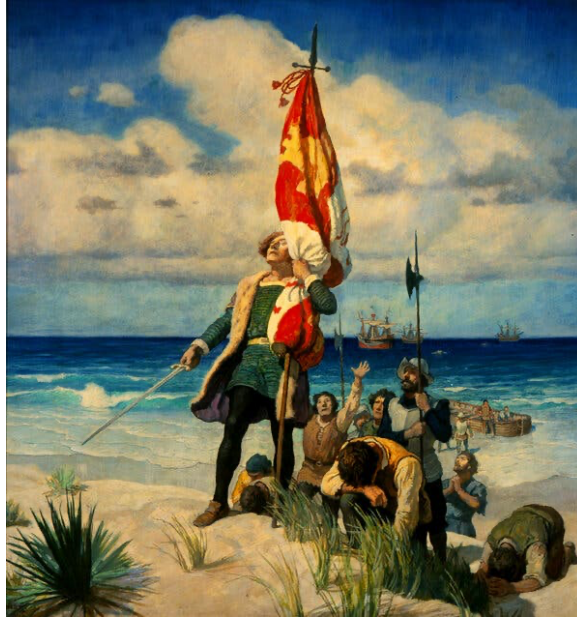
N.C. Wyeth's "Columbus Discovers America (The Royal Standard of Spain)," 1942.

many of us learn about as children and its grittier realities. “Arrivals,” a thought-provoking exhibition at the Katonah Museum of Art , uses historical and contemporary art to probe that gap. Curated by the art historian Heather Ewing, the show considers how newcomers to this land have shaped it and been received. Notably, the exhibition dispenses with the word “immigration” in favor of something more capacious: “Arrivals” includes those who may not fit official terminology. In its own way, the show still upholds the idea of the United States as a rare melting pot of peoples and ideas — except it’s not starry-eyed about it.