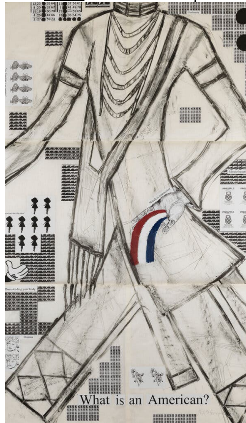
Jaune Quick-to-See Smith's print "What is an American?" 2001–03, which features a Native figure in casual stride, while a kind of red, white and blue rainbow spouts from a stigmata mark on its hand. Credit...Jaune Quick-to-See Smith

stigmata mark on its hand. It seems to suggest that the original inhabitants of this land were sacrificed for the sins of the new nation. Nearby, a photograph by Dorothea Lange just after the attack on Pearl Harbor tries to answer Smith's ever-relevant query: It shows a Japanese American grocery with a sign in the window reading, "I am an American." This claim to belonging was futile; the store was closed and its owner imprisoned in an internment camp.