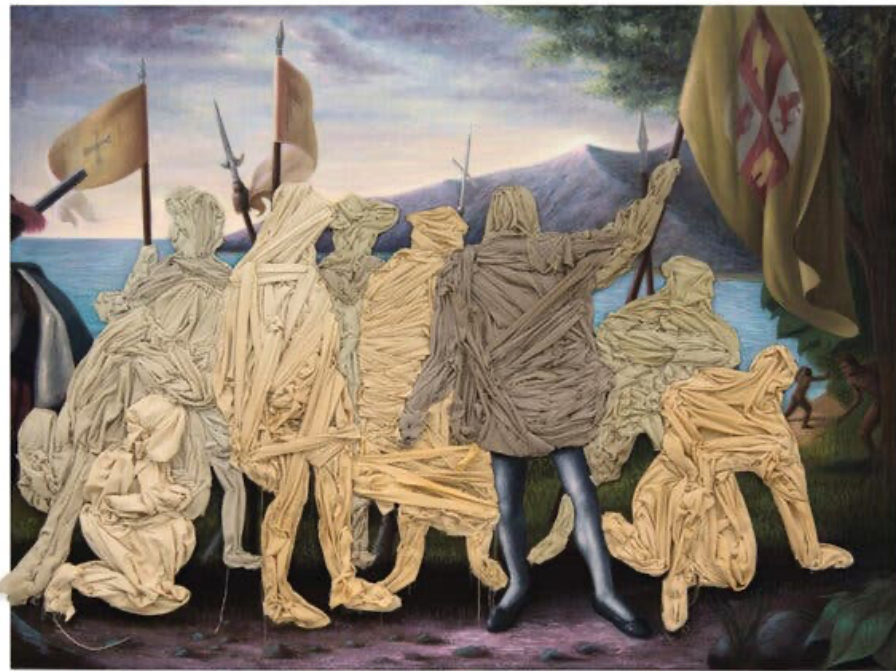
Titus Kaphar's "Columbus Day Painting" (2014), from the exhibition "Arrivals" at the Katonah Museum of Art. In a bit of revisionism, he replaces Columbus and his colonialists with blank, bunched canvas, muting the notion of heroism. Credit...Titus Kaphar

The United States has a vexed relationship with immigration. A core narrative of our country is that it is a melting pot, even though our government has excluded different groups of migrants for centuries. The much-vaunted nickname " nation of immigrants " leaves out those who were here before colonization (Native peoples) and those who were brought here against their will (enslaved Africans). There's a gap, in other words, between the romantic image of America