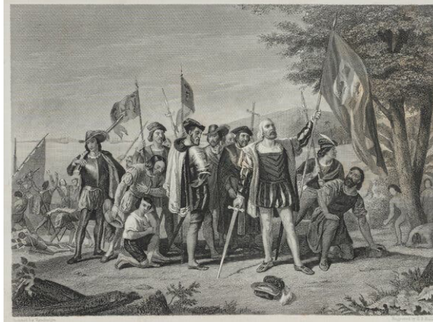
H.B. Hall's engraving "The Landing of Columbus," 1856 (from 1846 painting by John Vanderlyn).

The inclusion of Hall's copy, although it's small, helps you appreciate Titus Kaphar 's large "Columbus Day Painting" (2014) nearby. The piece borrows Vanderlyn's imagery but replaces the Spanish figures with blank canvas; bunched and wrapped, the canvas mutes their heroism and hints at their spreading of disease. Kaphar is famous for such art historical revisions, and they can sometimes feel gimmicky or overly clever. Seeing this one alongside the originals gives it a rebellious force.