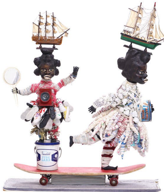
Vanessa German’s “2 ships passing in the night, or i take my soul with me everywhere i go, thank you” (2014), in which two Black girls created from found objects carry model ships on their heads. Credit...Vanessa German and Petrucci Family Foundation Collection of African American Art

“Arrivals” is, at heart, about identity, which is on trend for today’s art world. What makes it refreshing is that it uses a historical framework to take up a familiar subject. The show isn’t about race, ethnicity, or gender, though it touches on all those things. It’s about how artists can help bolster, complicate, or puncture national myths through their own stories and observations.