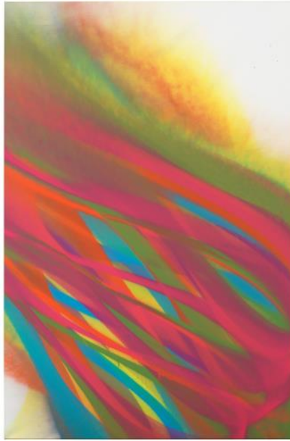
Katharina Grosse, "Untitled," 2022, acrylic on canvas, 238 x 158 cm, 93 11/16 x 62 3/16 inches; © Katharina Grosse and VG Bild-Kunst, Bonn, Germany 2023, photo by Jens Ziehe, courtesy of the artist and Gagosian.