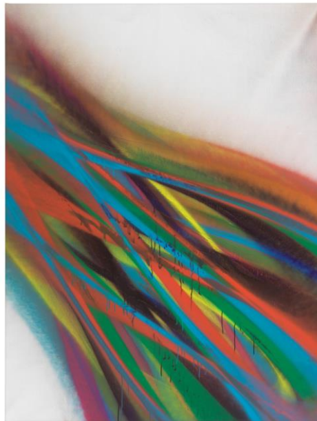
Katharina Grosse, “Untitled,” 2022, acrylic on canvas, 205 x 155 cm, 80 5/8 x 61 inches; © Katharina Grosse and VG Bild-Kunst, Bonn, Germany 2023, photo by Jens Ziehe, courtesy of the artist and Gagosian.

In “Touching How and Why and Where,” Gagosian is presenting a suite of new paintings from the German artist Katharina Grosse.