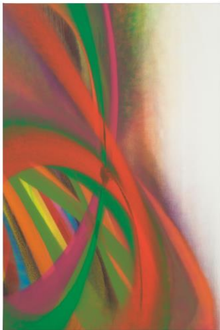
Katharina Grosse, "Untitled," 2022, acrylic on canvas, 200 x 135 cm, 78 3/4 x 53 1/8 inches; © Katharina Grosse and VG Bild-Kunst, Bonn, Germany 2023, photo by Jens Ziehe, courtesy of the artist and Gagosian.