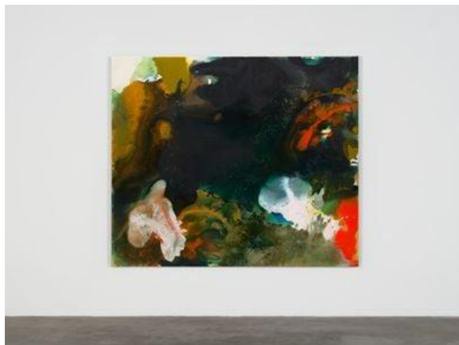
Mary Weatherford, The Proscenium (2023). Flashe on linen. 200.7 x 236.2 cm. © Mary Weatherford. Courtesy the artist and Gagosian. Photo: Fredrik Nilsen Studio.

So again, there's that place that the freediver talked to me about where one thing shifts into another. When I'm painting, I'm working with the differences in the weight of the paint. If I take some paint with a high viscosity and I pour it into say, a puddle of paint with a low viscosity, the thick paint will spread out at first, and then it'll pull the thin paint back over it like a veil. The push and pull of gravitational force is imitated in paint.