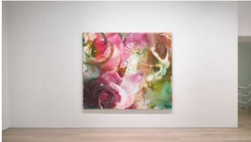
Exhibition view: Mary Weatherford, Sea and Space, Gagosian, New York (18 January–2 March 2024). Artwork © Mary Weatherford. Courtesy Gagosian. Photo: Owen Conway.

MW I always painted on the floor or table, then I built a wooden platform in my studio. I'm able to level it by adjusting the feet. That means that if I pour a bucket of water on the painting, the puddle will stay where it is. I don't know if you've done this, most people have, it's a childhood thing, if you see a water puddle, maybe with some dirt in it, you can draw in it with a finger. I learned to do that with the paint. I could put paint down, flood the canvas with water, and then draw into it with a sponge, which would be an erasure, but not quite an erasure because the water flows back in.