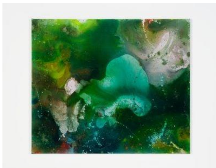
Mary Weatherford, Celadon Anemone (2023). Flashe on linen. 200.7 × 236.2 cm. © Mary Weatherford. Courtesy the artist and Gagosian. Photo: Fredrik Nilsen Studio.

A kind of otherworldly light illuminates her paintings from within—the result of a carefully prepared ground of white gesso mixed with marble dust. Working with vinyl-based Flashe paint, Weatherford pours and sponges swathes of colour across the canvas. Clusters of dense gestures are held in tension with areas of minimal paint, as the chalky surface absorbs the paint to a fresco-like effect.