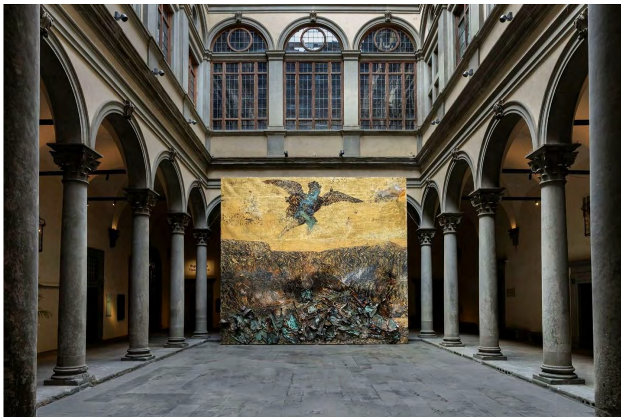
'Fall of the Angel' greets visitors to the Palazzo Strozzi © Anselm Kiefer.

In Florence's Palazzo Strozzi, German king of spectacle Anselm Kiefer meets his match. His exceptional exhibition Fallen Angels begins in the vast colonnaded courtyard with archangel Michael, a huge dynamic figure with outstretched wings, swooping across an eight-metre translucent gold ground. Below, rebel angels plummet into Kiefer's chaotic charcoal, shellac and fabric surfaces — our own dark material world, animated by the crowds thronging this inner square in the city centre. As Kiefer turns the popular Strozzi courtyard, with its wide benches and