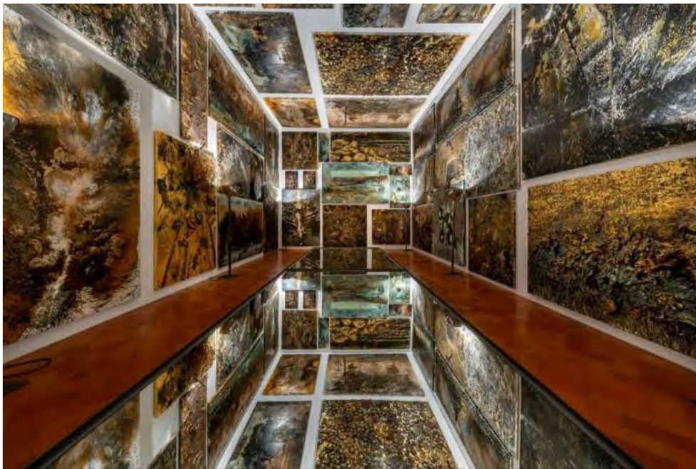
'Irradiated Paintings', a floor-to-ceiling immersive installation of 60 discoloured canvases from the past four decades

Including “ Heroic Symbols ”, photographs reprising Kiefer’s 1969 degree show where he posed making the Nazi salute in Paestum, Rome and other places emblematic of early western civilisation — he expected “the highest grade or nothing at all” — the exhibition is something of a mini-retrospective, as well as featuring pieces made especially for Florence. The self-portrait “ Sol Invictus ” ( Unconquered Sun , 1995), a painting where the artist lies on the ground drenched in life-renewing sunflower seeds, declares his customary unwavering self-conviction, but most of the display feels fresh, questioning and in lively debate with Renaissance ideas and its setting.