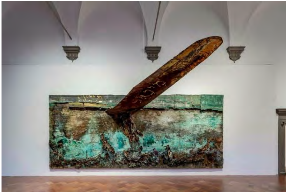
Kiefer’s painting ‘Lucifer’, with a dented wing from a military aircraft jutting out of the canvas © Anselm Kiefer.

In the first upstairs room, the rebellious angels return, this time as so many empty three-dimensional tunics, hanging off a toxic blue-green canvas. A gigantic sharp-edged wing — an actual dented wing from a military aircraft, relic of wartime disaster — juts out menacingly, sorrowfully, across the grand piano nobile gallery.