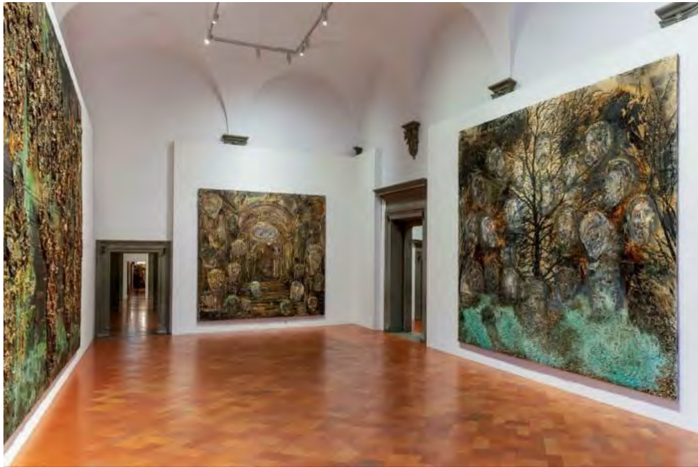
The gamble of Kiefer's career has been to make horror beautiful

It is therefore the show's most theatrical dialogue with the Renaissance. Preceded by a deliberately clumsy, bombastic canvas scrawled "Raffaello" and "La Scuola di Atene" which caricatures numerous philosophers' heads, "Irradiated Paintings" as an installation references Raphael's immersive Stanza della Segnatura in the Vatican. There "The School of Athens" is part of a cycle claiming harmony between ancient philosophy and Christian teaching — a foundational work of Renaissance optimistic humanism. Kiefer's tragicomic scenario of blurry disintegration-by-radiation is its parodic opposite.